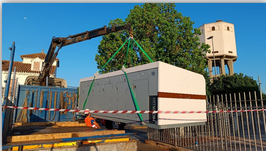
11. INSTALLATION OF THE POD NEAR THE TOWN HALL