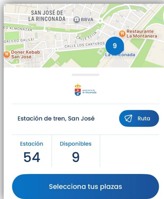
5. SCREENSHOT OF THE NOVALITY APP SHOWING HOW IT WORKS

All these services, along with alarm and malfunction notifications, will be available to users on Novality , a mobile app and website dedicated to this service. The app is compatible with iOS and Android devices.