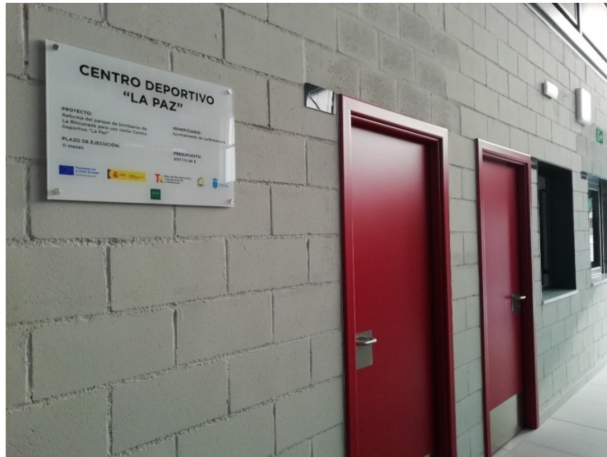
11. LOCATION OF THE ACRYLIC PLAQUE WITH INFORMATION ABOUT THE PROJECT