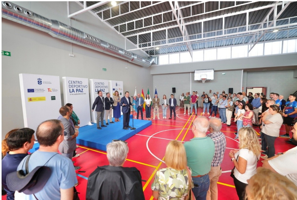
16. LA PAZ SPORTS CENTER OPENING CEREMONY (II)