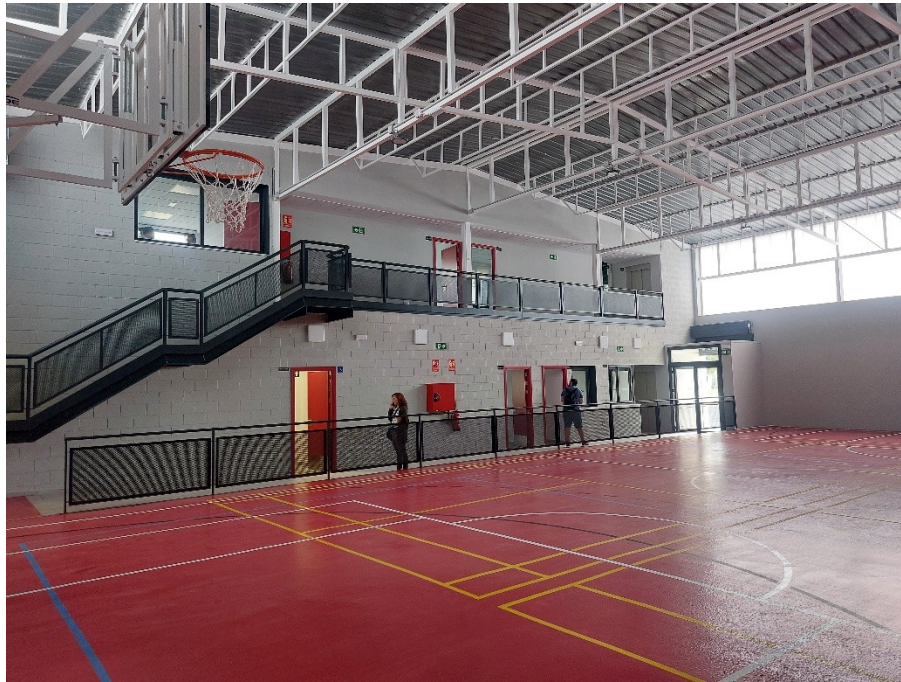
13. INTERIOR OF LA PAZ SPORTS CENTER