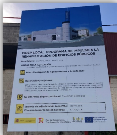
4. PIREP REMODELING SIGN BY THE ENTRANCE (I)

It is important to note that all communications issued display all the elements required by the EU reference standards: the EU emblem, the NextGenerationEU co-funding statement, and the Recovery, Transformation and Resilience Plan statement. These elements are displayed clearly in this report, as well as in any and all advertising spots, documents, videos, invoices, etc.