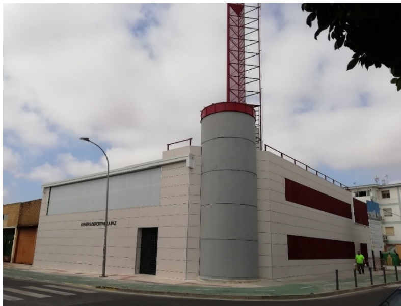
12. EXTERIOR OF LA PAZ SPORTS CENTER