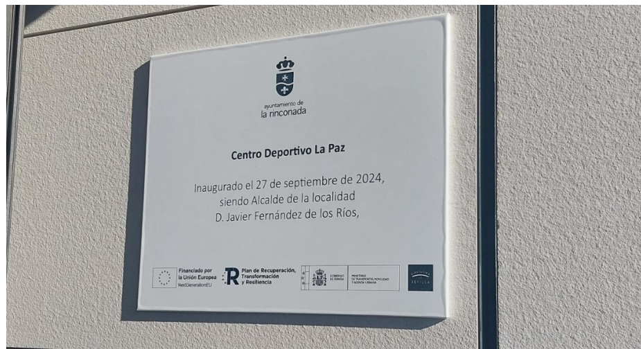
18. ACRYLIC PLAQUE COMMEMORATING THE SPORTS CENTER OPENING CEREMONY