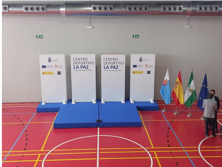
17. LA PAZ SPORTS CENTER OPENING CEREMONY (III)