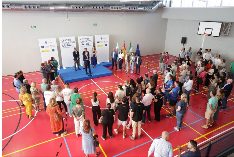
15. LA PAZ SPORTS CENTER OPENING CEREMONY (I)