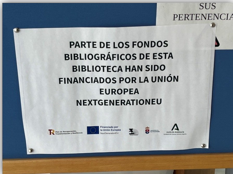
8. SIGN IN THE SAN JOSÉ DE LA RINCONADA PUBLIC LIBRARY